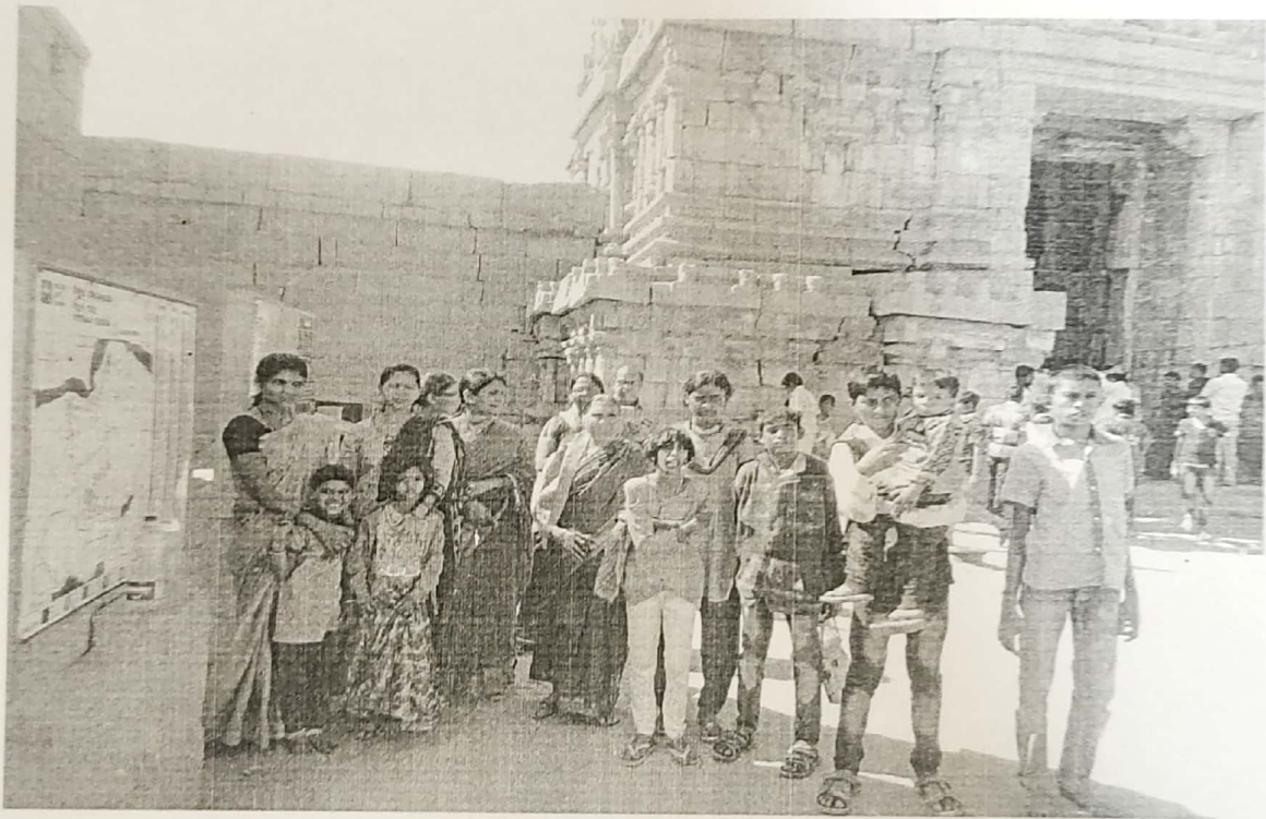
One day picnic at Hampi and Hospet For School Childrens and their Parents.