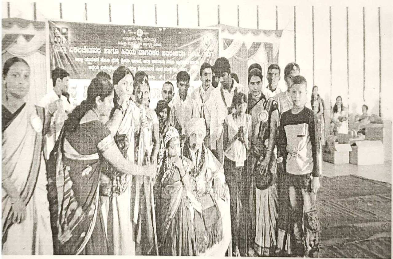
rticipated in various games and won prizes.