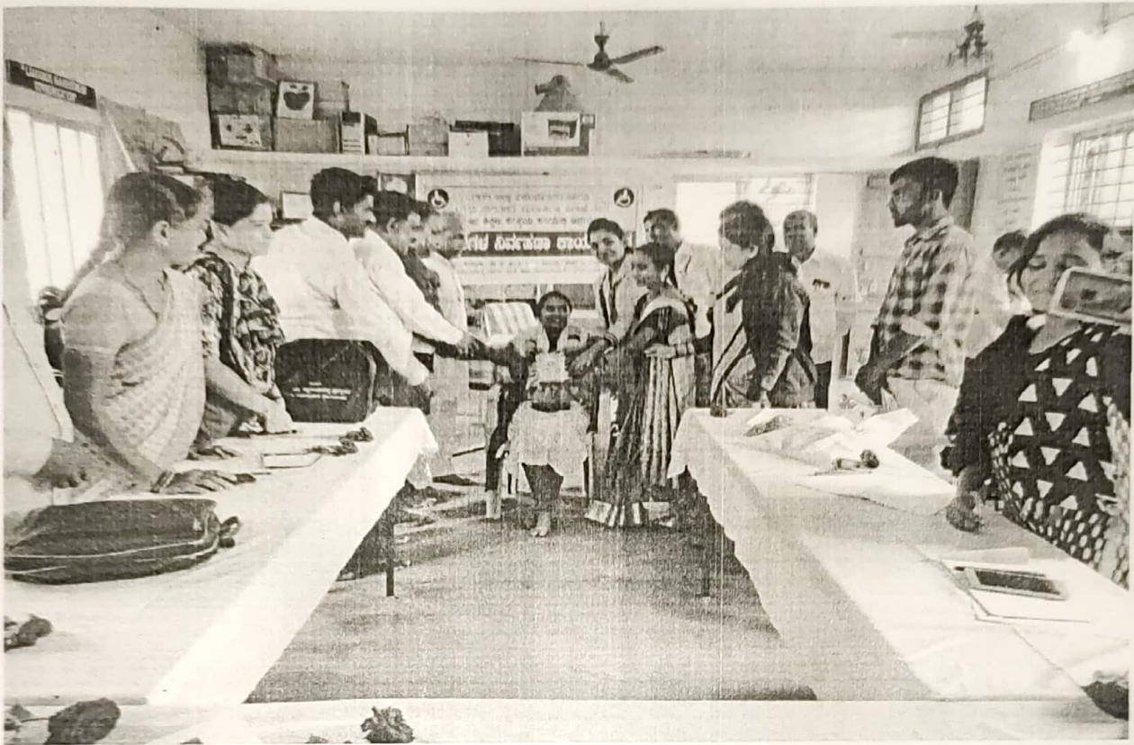
DDWO Madam conducted one day training program at Manju Education Trust, Gadag -Betageri